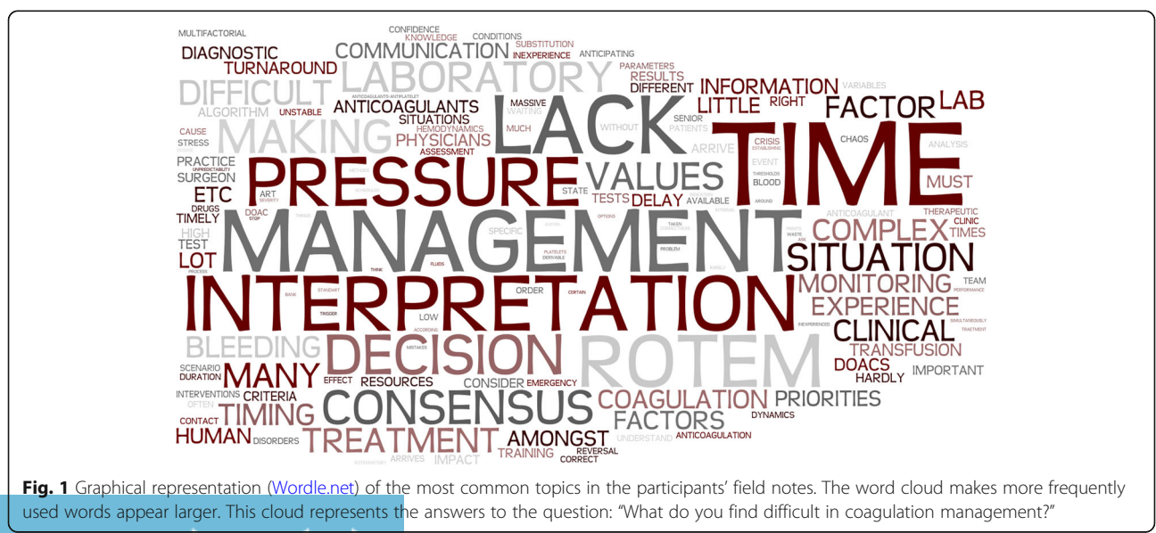
Fig. 1 Graphical representation ( Wordle.net ) of the most common topics in the participants’ field notes. The word cloud makes more frequently used words appear larger. This cloud represents the answers to the question: “What do you find difficult in coagulation management?”

We present the survey results of the quantitative part of this study as medians with interquartile ranges. Further, we used the Wilcoxon signed ranked test for one sample to test if the median differed from a neutral rating of each statement. Moreover, we used the Mann-Whitney test to investigate rating differences between the two